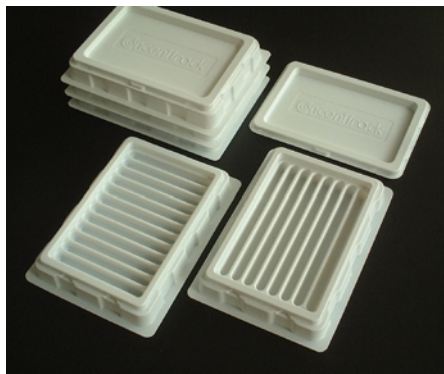
PiresTrack™ Pipette Reservoirs